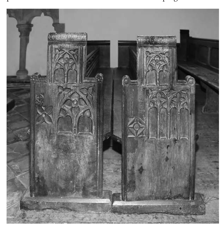
FIG. 115 - Decorated ends of two pews in Barrow church.

Church pews are currently the subject of much debate for the practical reason that many parishes wish to move or remove them in keeping with modern forms of worship. Part of their